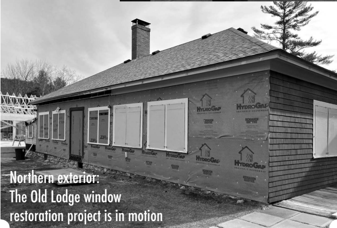
Northern exterior: The Old Lodge window restoration project is in motion