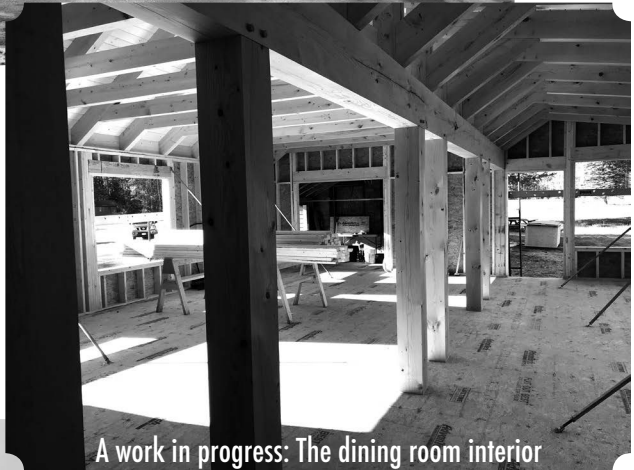
A work in progress: The dining room interior